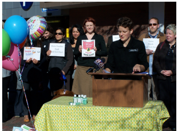
The Maine Women's Lobby delivers a "get well" basket to the Portland Chamber of Commerce. Advocates ask them to "wash their hands of their previous position on paid sick days."